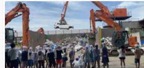
Matsumoto City Meizen Elementary School, 4th grade

ECONECOL Inc. Matsumoto Branch welcomes children to tour its plant. We put a lot of effort into each event so that students can continue to learn through lectures and tours. With the increasing interest in recycling around the world, children have a high interest in recycling and ask many questions, making these tours a meaningful use of time. We will continue to carry out activities that lead to a bright future.